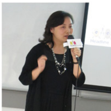
Interview skills and career planning workshop was conducted on March 19, 2010