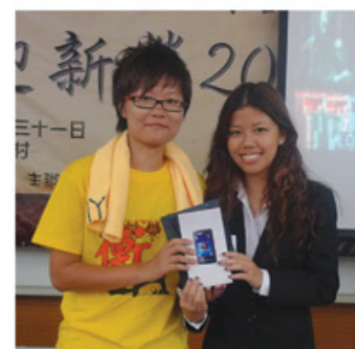
The First Prize of lucky draw was a Sony Ericsson Xperia™ X10 mini.