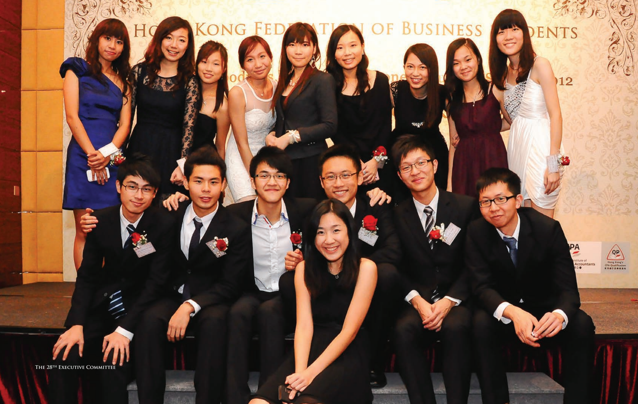
THE 28 TH EXECUTIVE COMMITTEE