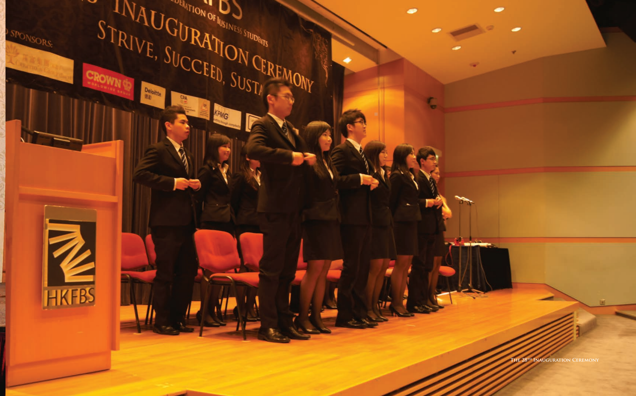
THE 28 TH INAUGURATION CEREMONY